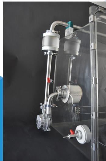
Inline filter cartridge for circulation system