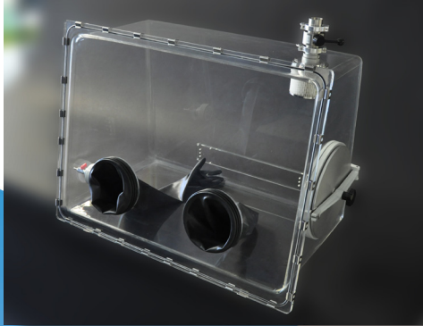
Overview of the MB-ACRYL-P-D